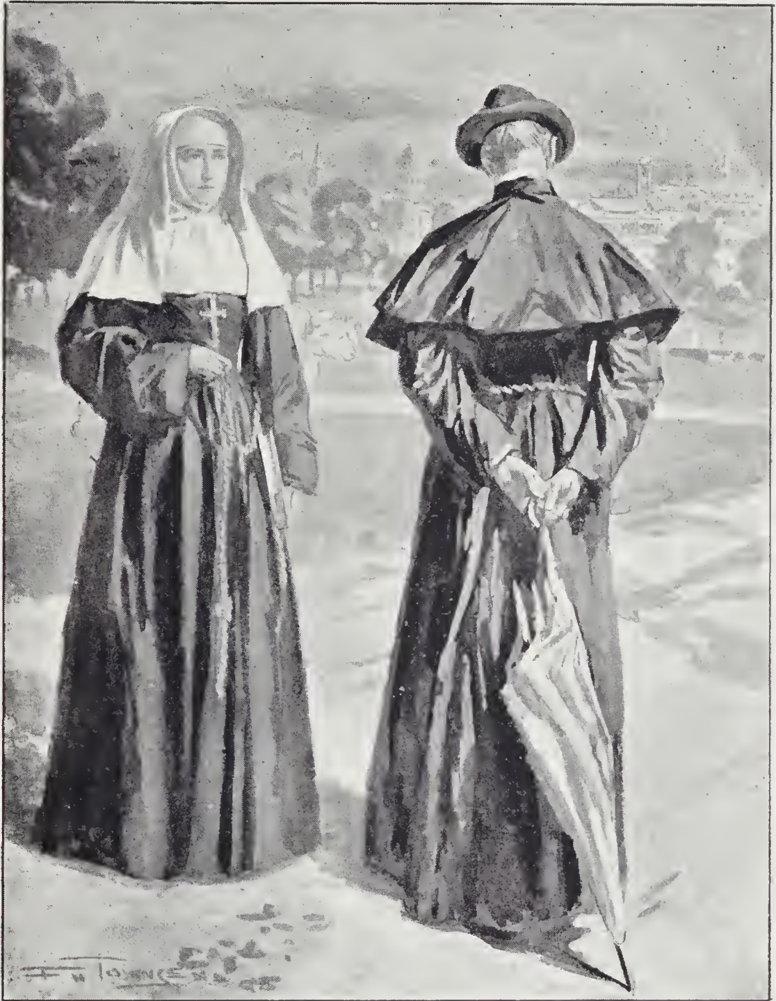
"GOD'S WAYFARER," SHE MURMURED